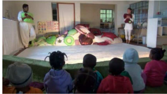
Fingers and Toes, My Body Knows © ASSITEJ South Africa