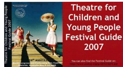
ASSITEJ Festival Guide 2007