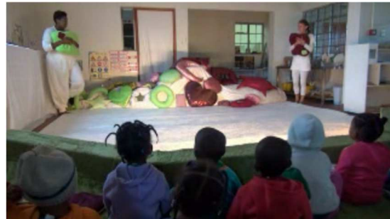
Fingers and Toes, My Body Knows © ASSITEJ South Africa