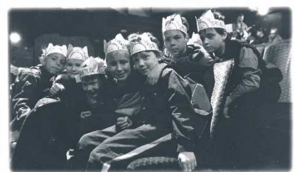
Children At Theatre