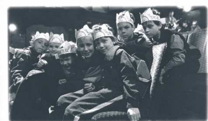
Children At Theatre