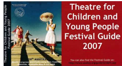
ASSITEJ Festival Guide 2007 © ASSITEJ